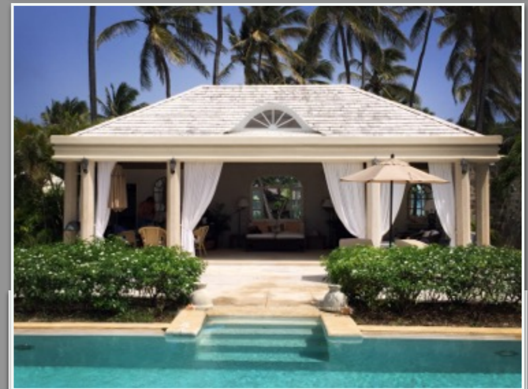
Pool Pavilion with Bar area

Sea Star is a relaxing and secure environment, thanks to the strict security provided by the Mustique Co., which operates the ferry and airport, and pays the full-time staff that resides on the island.